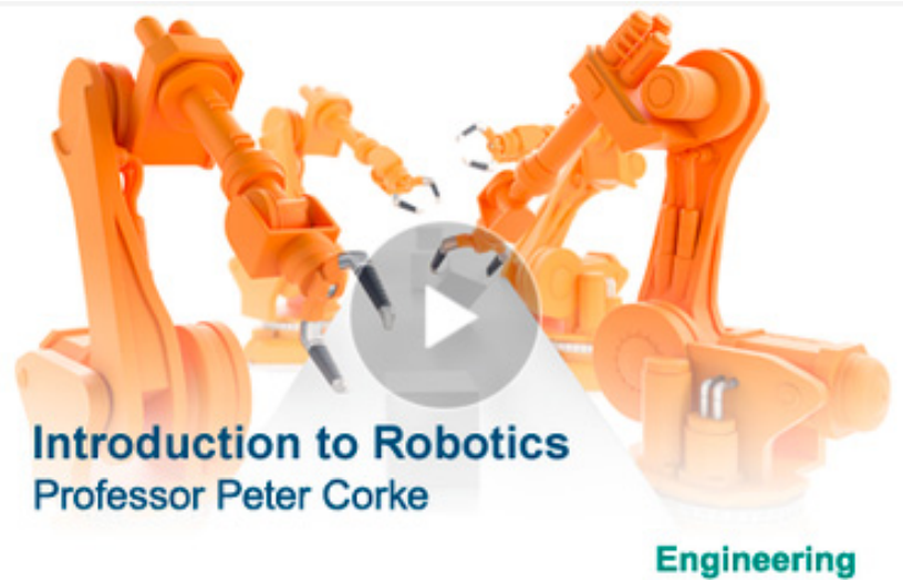
Picture 1. Introduction to Robotics