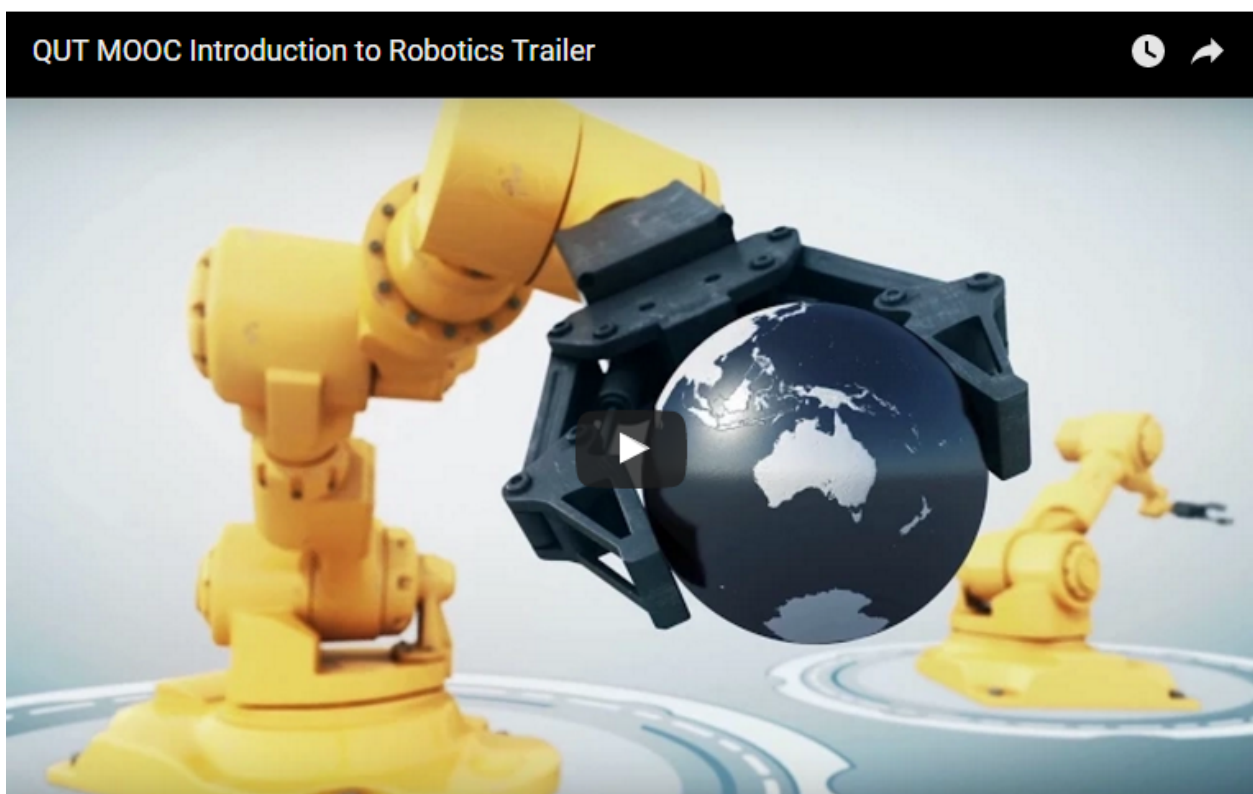
Picture 2. Introduction to Robotics MOOC